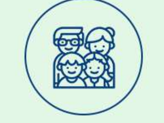
Upto 4 Family Members