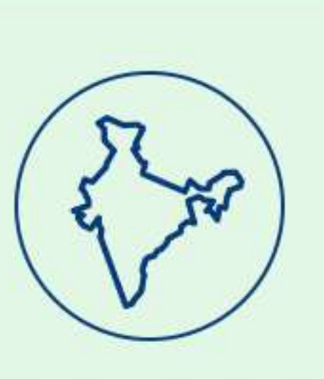
PAN INDIA coverage