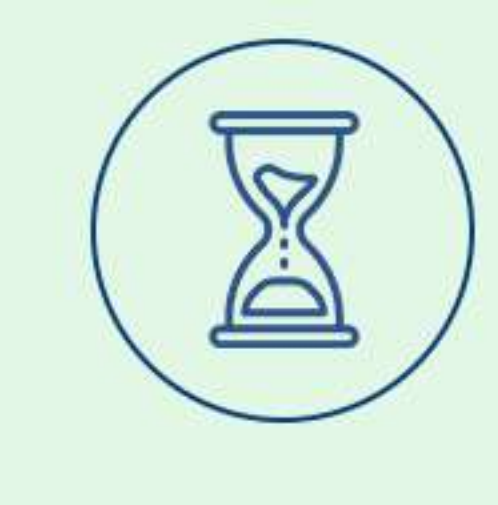
Zero waiting Period